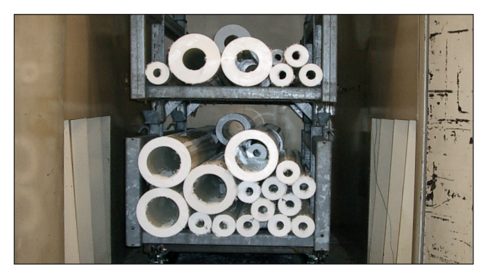
Figure 3: Annealing to reduce tensions

storage, with a temperature closed to the heat distortion temperature, the chains mobility increases and the stress relaxation accelerates. In this case, the stress relaxation and the associated warping are faster and more intensive. If the semi-finished products are subjected to a annealing process, the warping is partially anticipated.